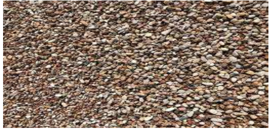
Figure 2: Marble Chunks

MARBLE POWDER: The Marble chunks used are of same size as fine aggregate and bought from the local marble supplier.